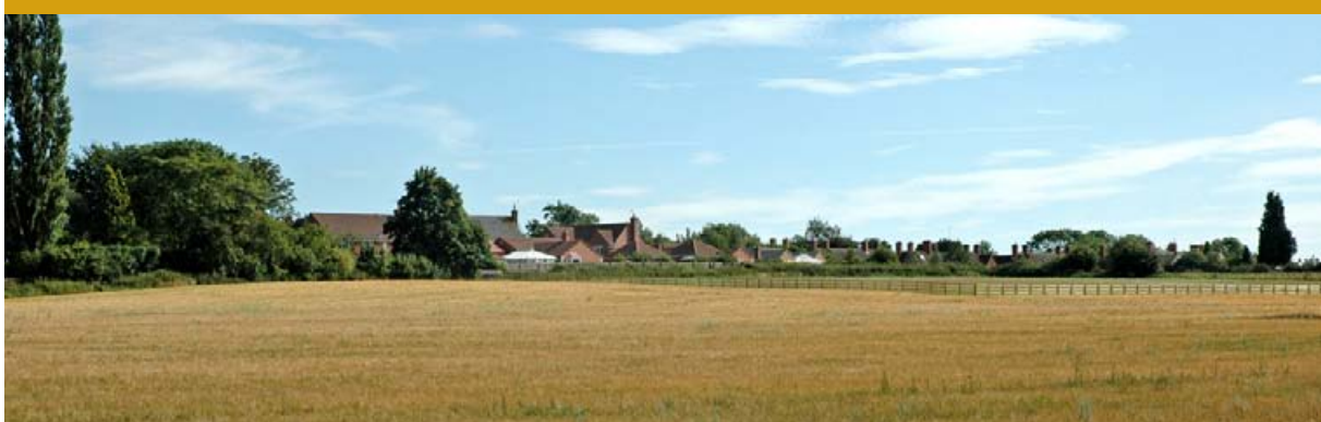
Affluent adjacent residential development to the south