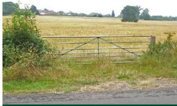
Access off Bradgate Road

The site benefits from gated access off Bradgate Road through an 8 metre easement (shown blue on the site plan).