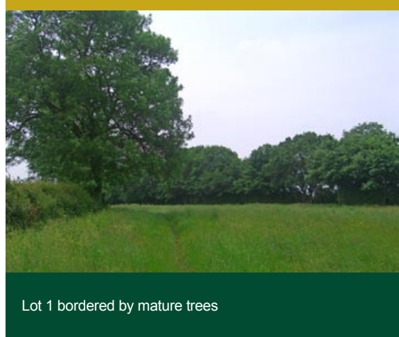
Lot 1 bordered by mature trees