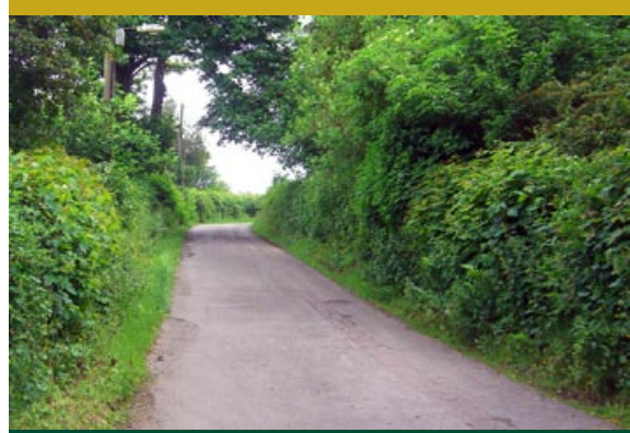
Wigginton Bottom where there is access to the site

The land is designated within the Greenbelt and any development would be subject to planning permission.