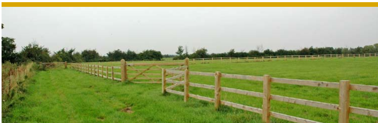
Fenced access strip leads to gated entrances to each of the paddocks

To arrange a site visit, please call 01727 817479