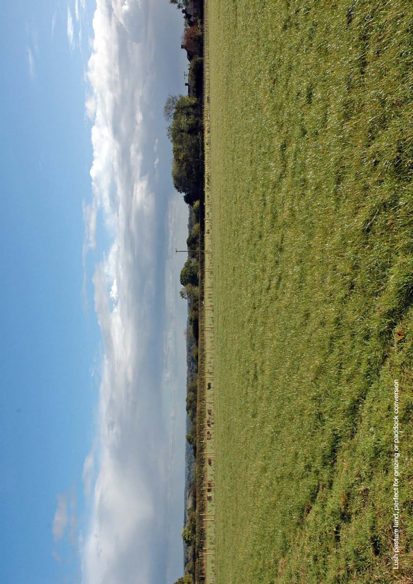
Lush pasture land, perfect for grazing or paddock conversion