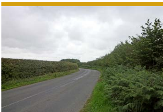
Extensive road frontage onto Mudds Bank off the A40

It is also home to Bicester Village, the leading outlet shopping destination in Europe and a major international tourist attraction.