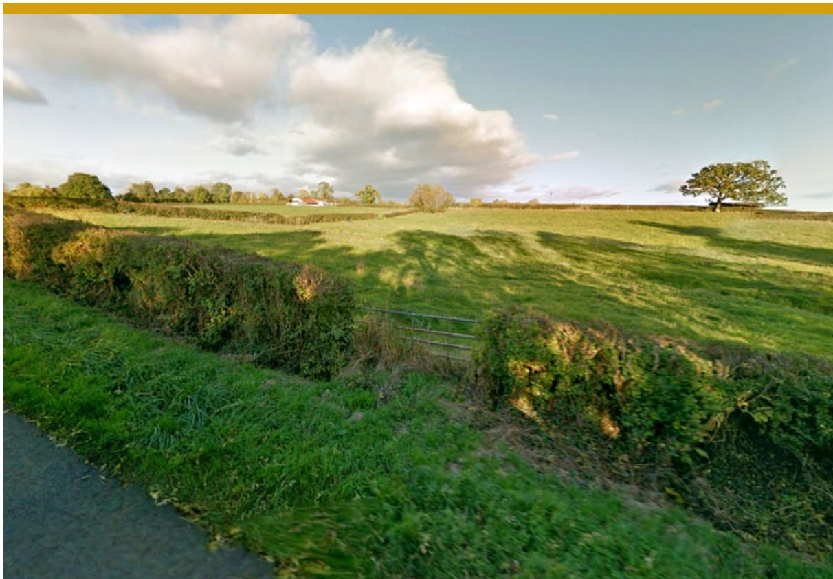
Road frontage and gated access from Berrowhill Lane

To arrange a site visit, please call 01582 788878 or email enquiries@vantageland.co.uk .