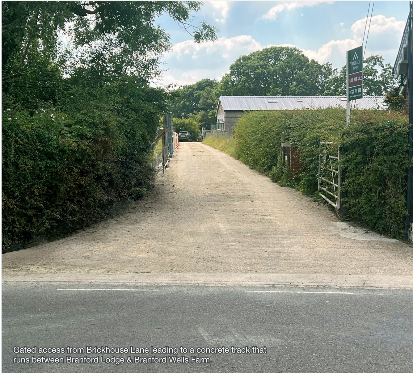
Gated access from Brickhouse Lane leading to a concrete track that runs between Branford Lodge & Branford Wells Farm.