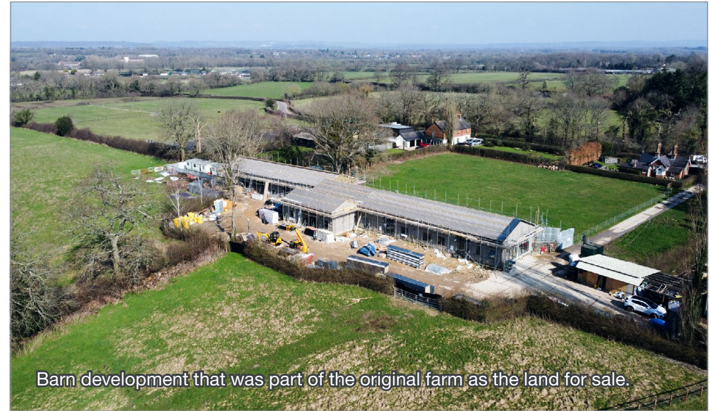
Barn development that was part of the original farm as the land for sale.

Development is permitted if the agricultural building has been in use for at least 10 years. The maximum floorspace that can be developed is 465m 2 , which can be divided into up to five separate dwellings. require any further information.