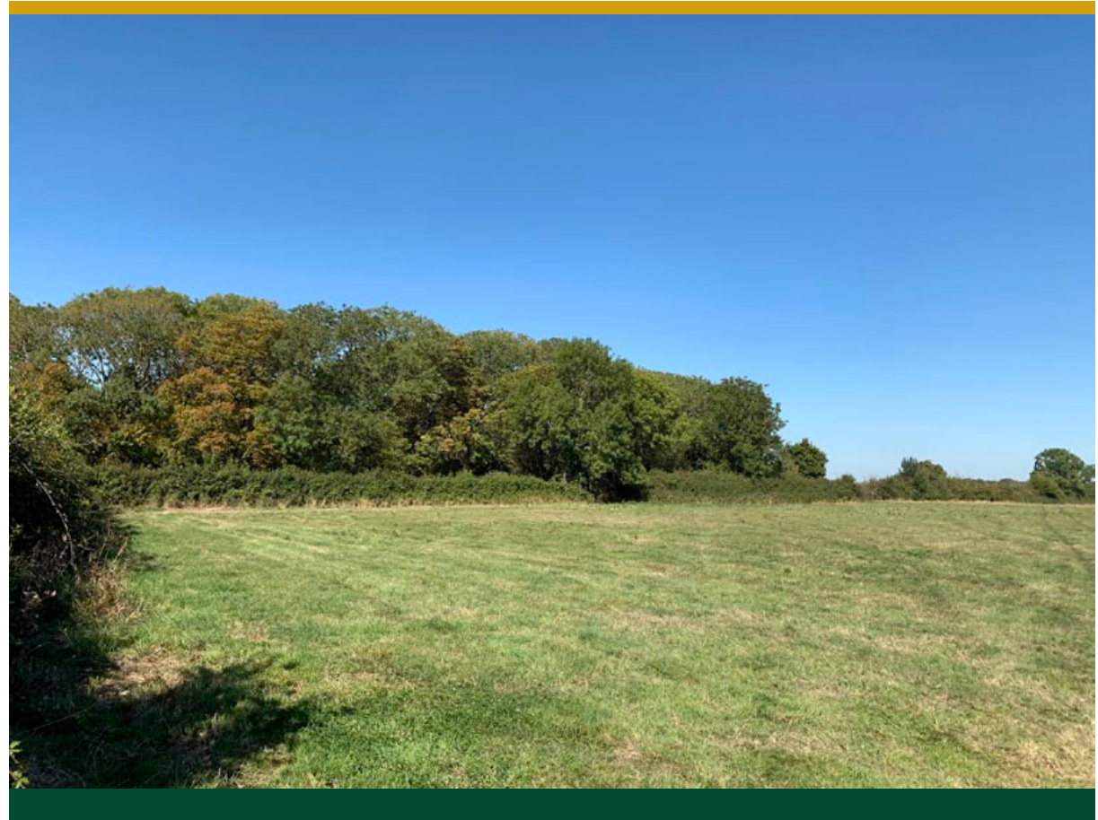
Lush flat grazing land