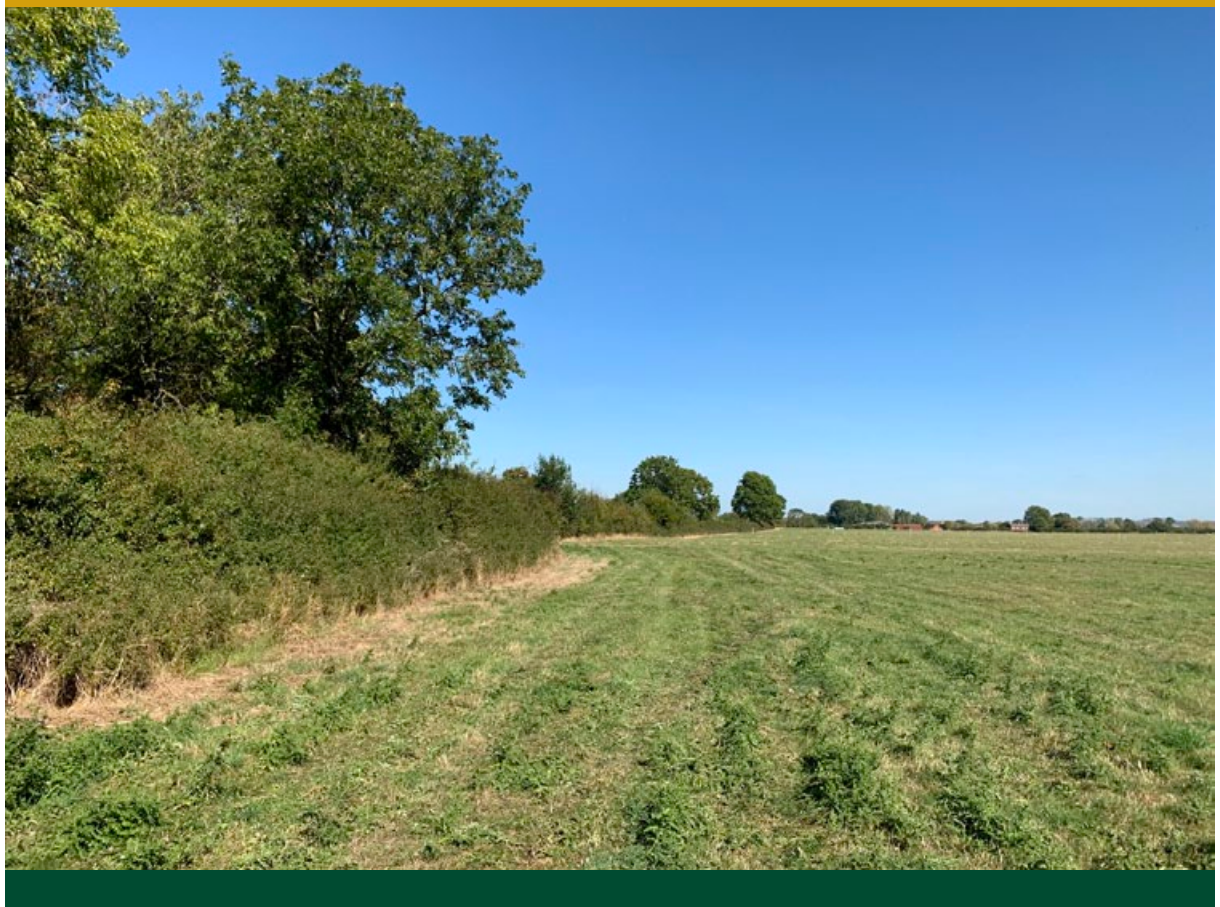
Ideal for paddock use with a 2 mile bridleway lying close to the land