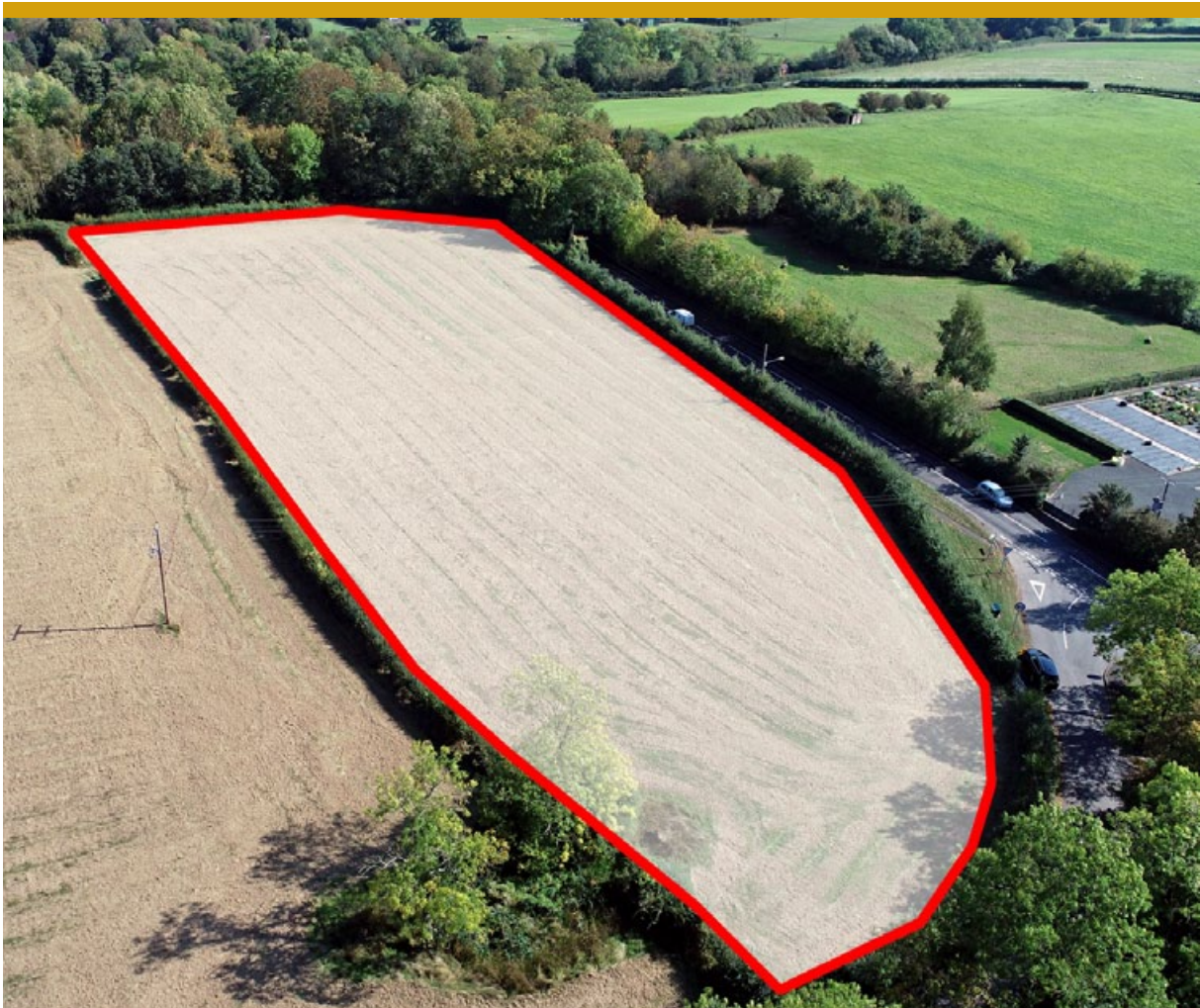
Self-enclosed field with extensive road frontage and its own private gated access.

A range of attractions can also be found farther afield including the iconic Malvern Hills Area of Outstanding Natural Beauty and the hugely popular tourist town of Stratford-upon-Avon – the birthplace of William Shakespeare.