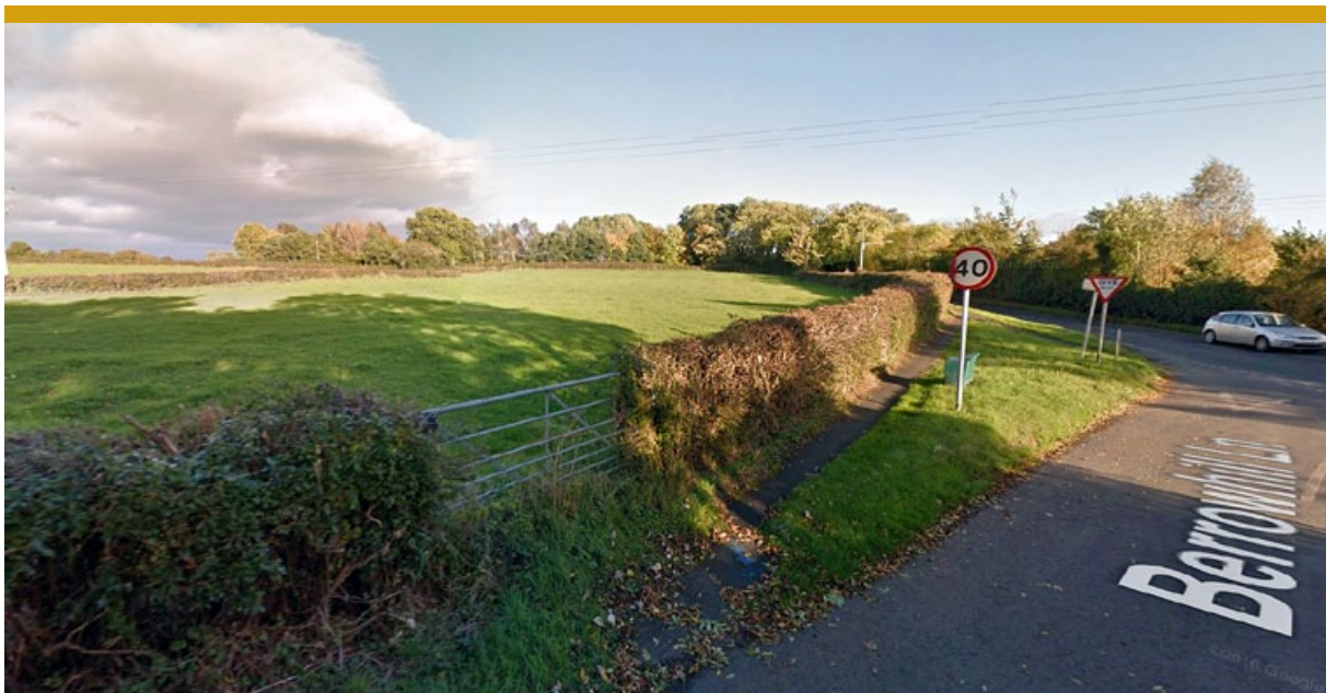
Extensive road frontage onto Droitwich Road & Berrowhill Lane with own private gated access.

To arrange a site visit, please call 01727 701303 or email enquiries@vantageland.co.uk .