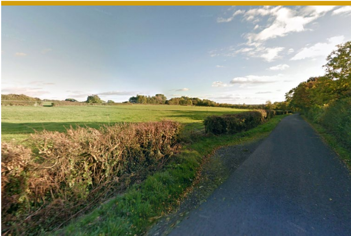
Road frontage and gated access from Berrowhill Lane

To arrange a site visit, please call 01582 788878 or email enquiries@vantageland.co.uk .