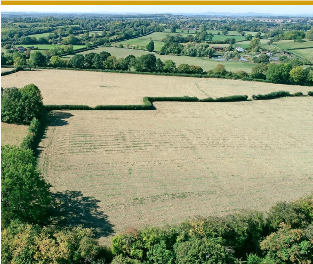
View over Lots C4a, C3a & A

A range of attractions can also be found farther afield including the iconic Malvern Hills Area of Outstanding Natural Beauty and the hugely popular tourist town of Stratford-upon-Avon – the birthplace of William Shakespeare.