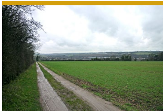
Established track off Cold Harbour Lane

The land is subject to an Overage Provision of 25% for a period of 19 years for any increase in value accruing to the land because of planning permission. Please call 01727 701303 for more information.