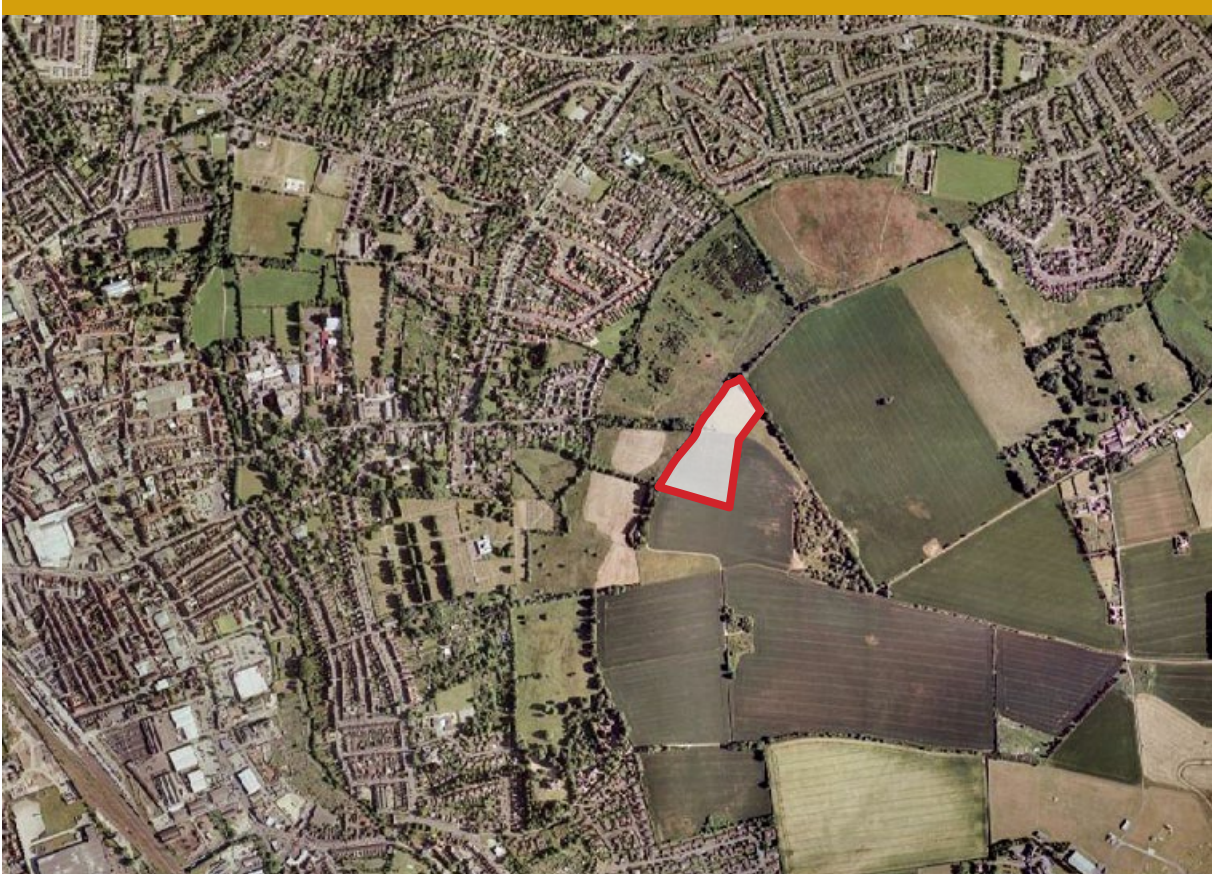
Aerial image of the land for sale in Grantham