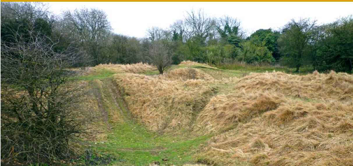
Jumps at the track on Hall's Hill