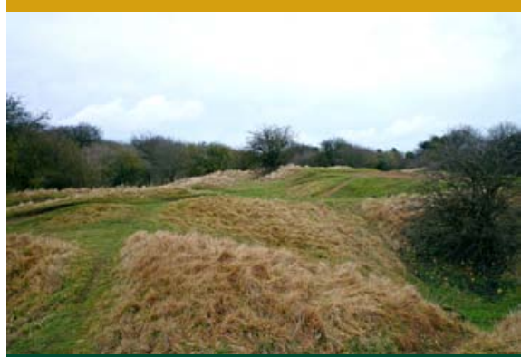
Track on Hall's Hill