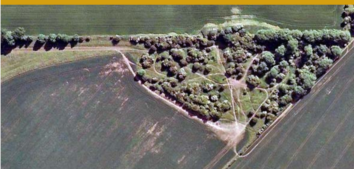
Aerial photograph of the track on Hall's Hill