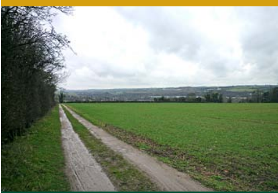
Established track off Cold Harbour Lane