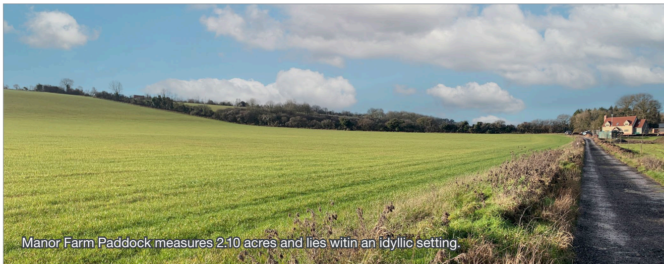
Manor Farm Paddock measures 2.10 acres and lies within an idyllic setting.

The land is subject to an Overage based on 20% of any uplift in value following the grant of planning permission for development other than for agricultural, equestrian or forestry purposes. The Overage period is 80 years from 2017 and is for the benefit of a previous owner.