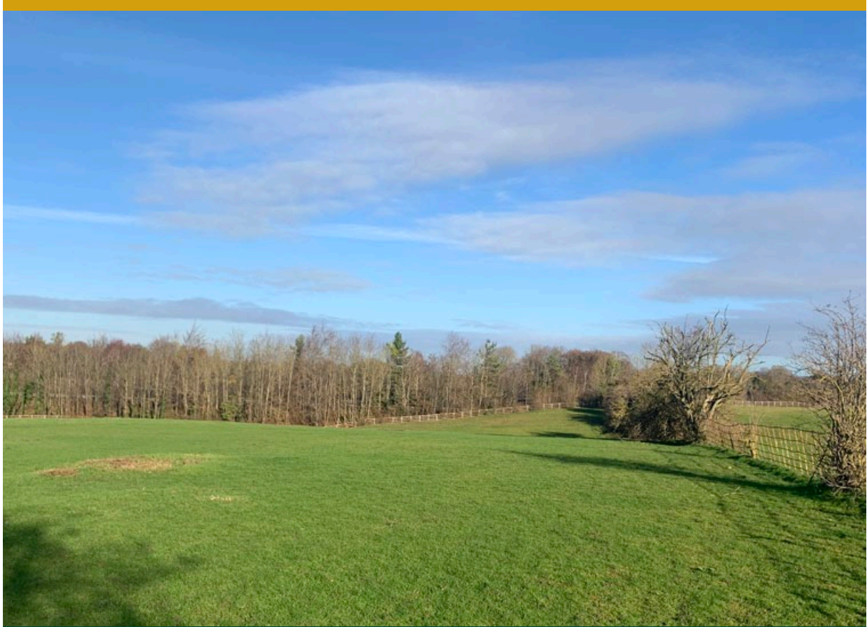
The site is bounded by a mixture of fencing and mature hedgerows & trees.