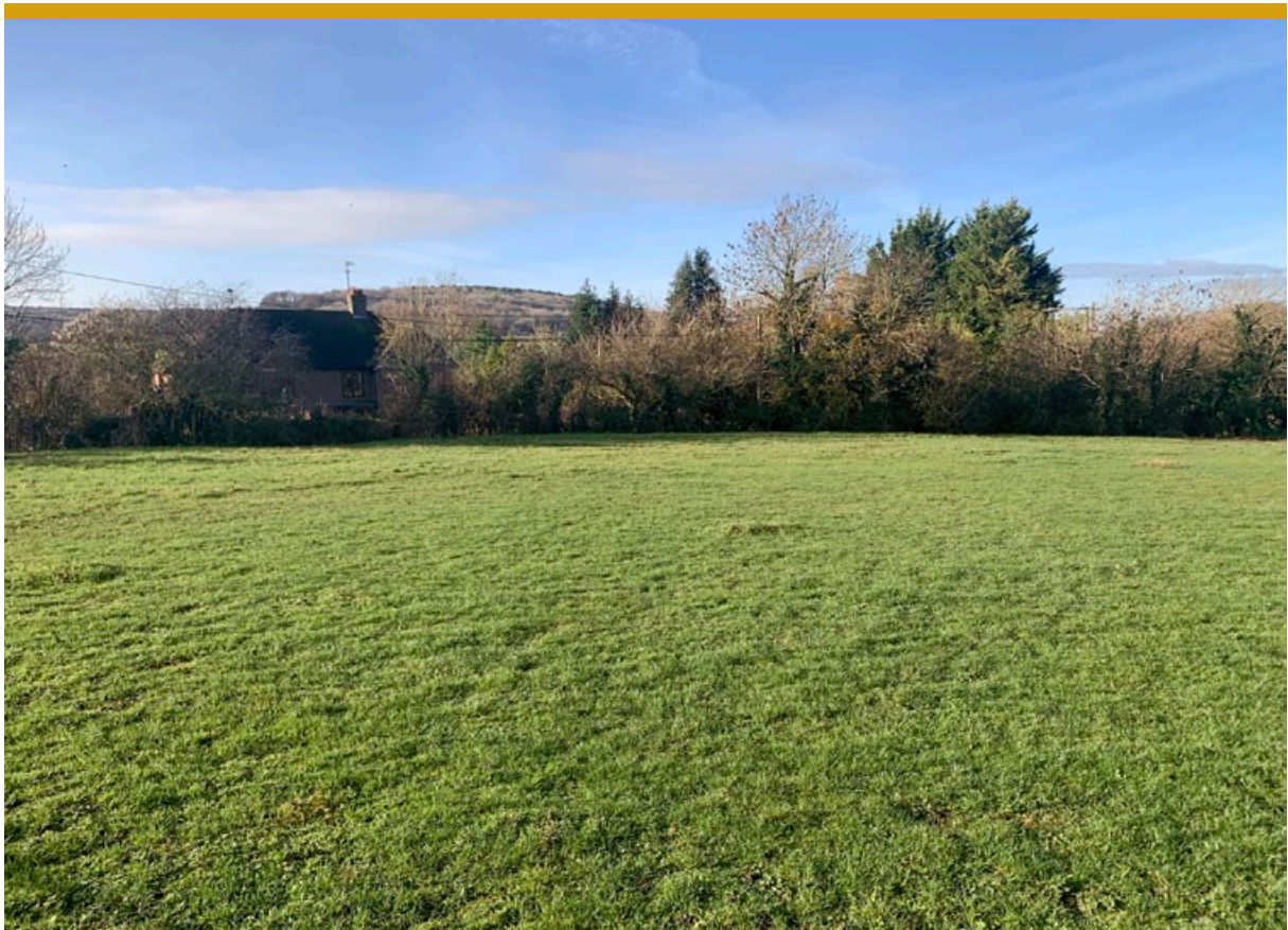
Lush pasture land in an affluent area.