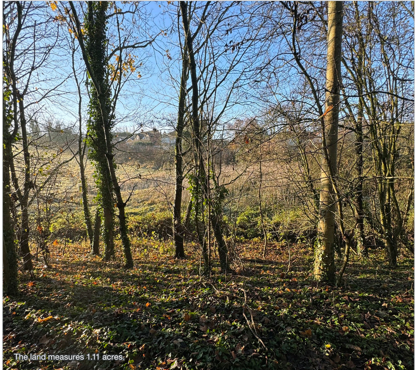
The land measures 1.11 acres.

Dunstable Downs and Whipsnade Zoo – the UK's largest – are very close by, as is the excellent Stockwood Park & Discovery Centre.