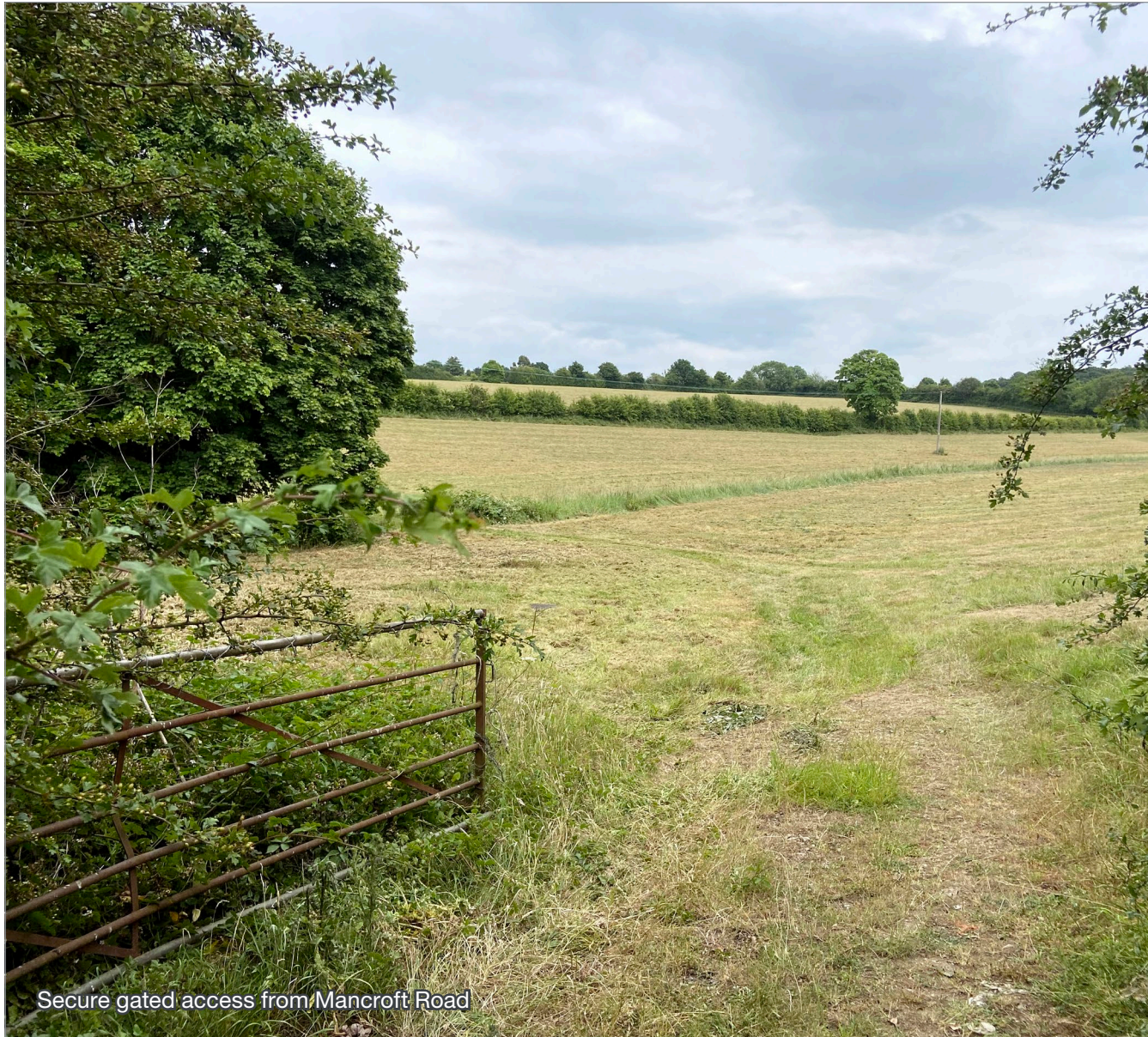
Secure gated access from Mancroft Road