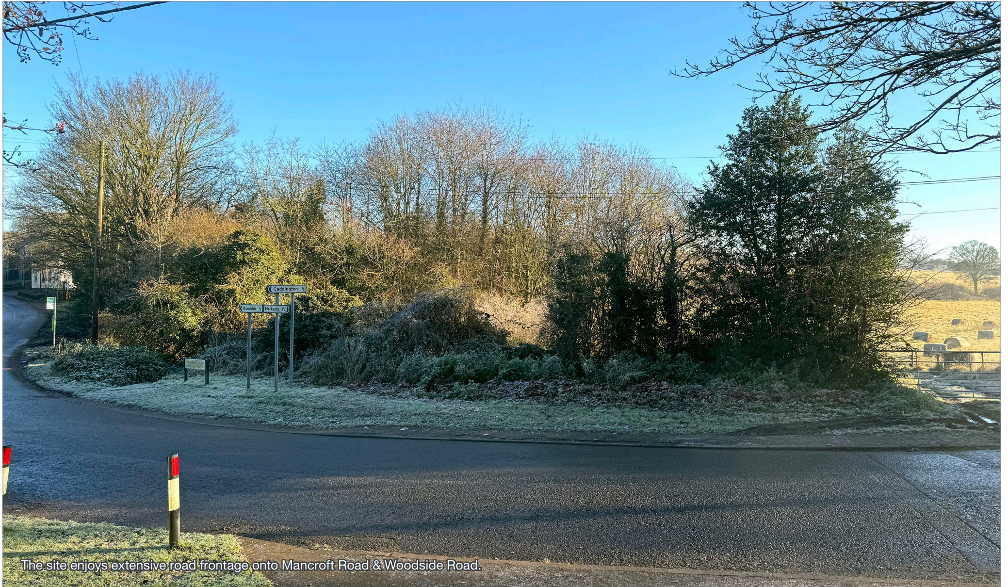
The site enjoys extensive road frontage onto Mancroft Road & Woodside Road.